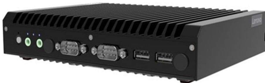
Figure 3. Agilent Connected Instrument Device (CID) for OpenLab CDS physical hardware configuration. Note: Actual device may appear different than the image shown.

The CID hardware is an IoT device that comes ready for instrument connectivity with pre-installed Operating System (OS) and OpenLab CDS software. For more details, contact your local Agilent sales representative.