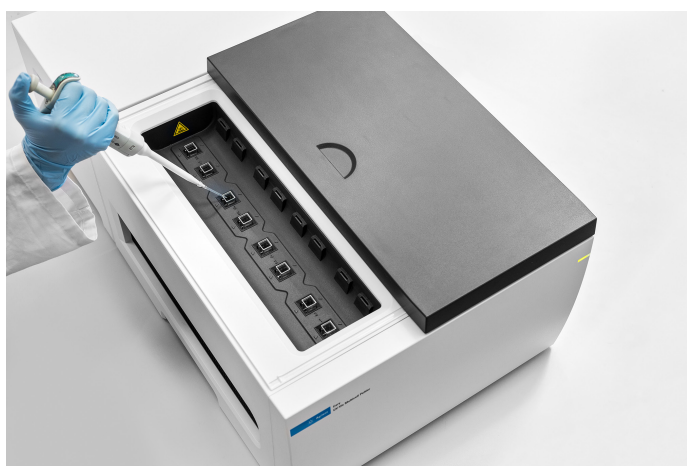
Figure 1. The Agilent Cary 3500 UV-Vis multicell spectrophotometer can be used for up to four temperature experiments across eight cuvette positions, simultaneously.

To understand the function of biomolecules, various techniques are used to analyze and characterize them. While UV-Vis spectroscopy is a well-established technique suited to biomolecule characterization studies, the Agilent Cary 3500 UV-Vis spectrophotometer (Figure 1) includes many features and benefits that will accelerate biomolecule research.