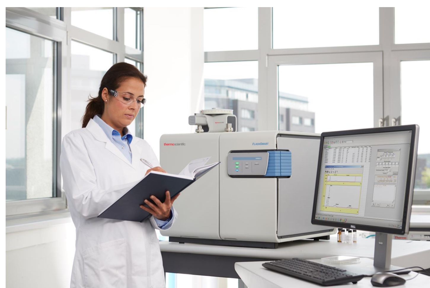
Figure 1. FlashSmart Elemental Analyzer.

The FlashSmart EA uses helium as carrier gas, which ensures high sensitivity. Considering the need for cost efficiencies and the likely increase in helium gas cost, due to its possible shortage, an alternative for the carrier gas, is needed. Argon which is readily available, can be used as alternative to helium in the FlashSmart EA.