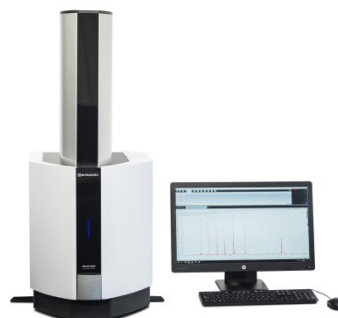
Fig. 1 Shimadzu MALDI-8020 benchtop linear MALDI-TOF instrument