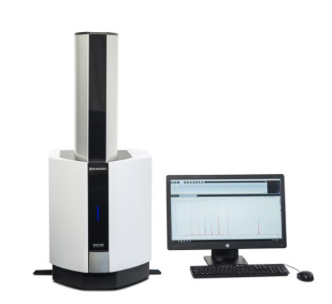
Fig. 1 MALDI-8020 benchtop linear MALDI-TOF instrument