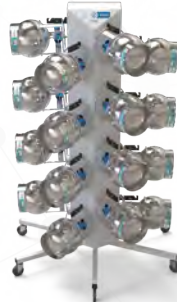
7016D Canister Autosampler