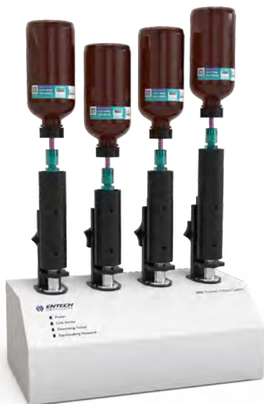
The 5400B Thermal Transfer System