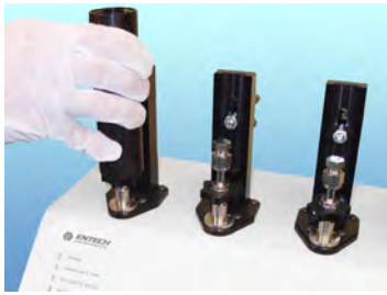
1 Attach trap heater onto 5400B assembly.