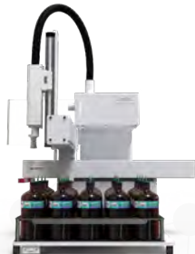
7650-L20 GC Gas Autosampler