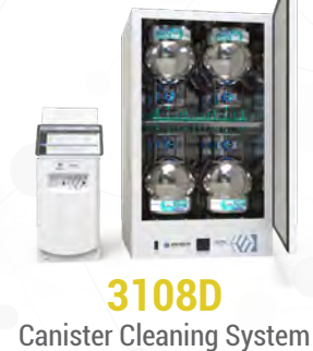
3108D Canister Cleaning System

The Recognized Global Leaders in Environmental Air Analysis.