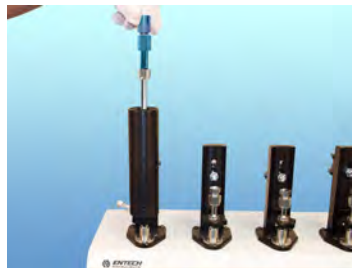
4 Insert tube with fitting into tube heater.