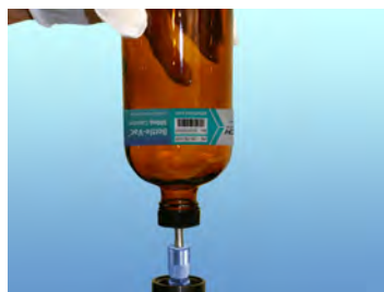
6 Attach an evacuated container to the top.