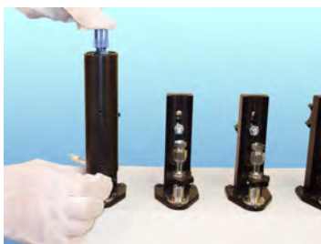
5 Gently snug thumb-wheel on bulkhead fitting and perform pressurized leak check.