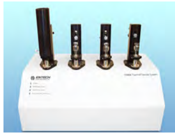
2 Attach other trap heaters as needed.