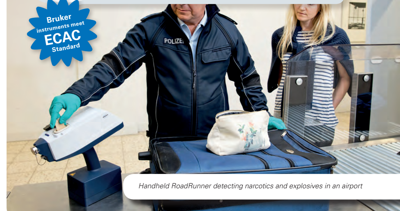
Handheld RoadRunner detecting narcotics and explosives in an airport