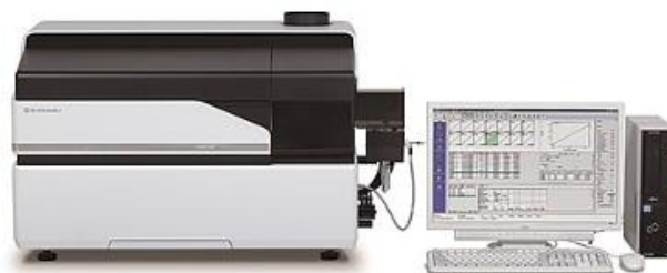
Figure 1. ICPMS-2030

Weighted sample (approximately 0.4g) was transferred into the vessel of microwave digestion system (Milestone Ethos Easy). Concentrated strong acids, hydrogen dioxide in ultrapure grade and DI water were added into each vessel shown in Table 2.