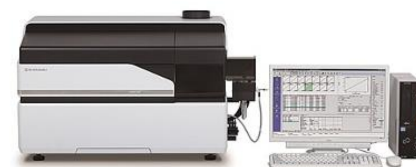
Figure 1: ICPMS-2030

Food safety may occur in food planting, processing and packaging. It has drawn great concerns due to air and soil pollution, environmental contamination and misuses of additives and materials in food processing and other human activities. Metal toxicity can be acute or chronic, depending upon one's dietary intake and duration of exposure. Toxic elements such as As, Cd, Pb and Tl are well known as they are among the most hazardous materials present in food chain based on their prevalence and the severity of their toxicity. Even at low concentration, these heavy metals could be potential threats to human health. Cr, Ni, Se are either required for plant growth or considered as essential micronutrient elements. However, they would become toxic at high concentrations. The determination of trace level metals in food is critical for food safety and human health [1, 2]. Among various techniques for heavy metal analysis, ICP-MS is the most ideal and reliable technique for measuring toxic elements in food due to its superior low detection limit, high throughput, wide linearity range and less interferences.