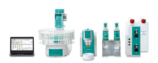
Figure 1. 884 Professional VA, fully automated for voltammetric analysis.

The scTRACE Gold is electrochemically activated prior to the first determination.