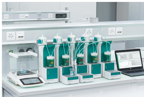
Figure 1. When equipped with an Optrode M2, the OMNIS Professional Titrator with OMNIS Dosing Modules (shown here) are ideal for acid number determination in biodiesel.

An appropriate amount of sample is weighed into the titration beaker, and pre-neutralized 2-propanol as well as phenolphthalein solution are added. The solution is titrated until after the first break point with standardized potassium hydroxide in 2-propanol.