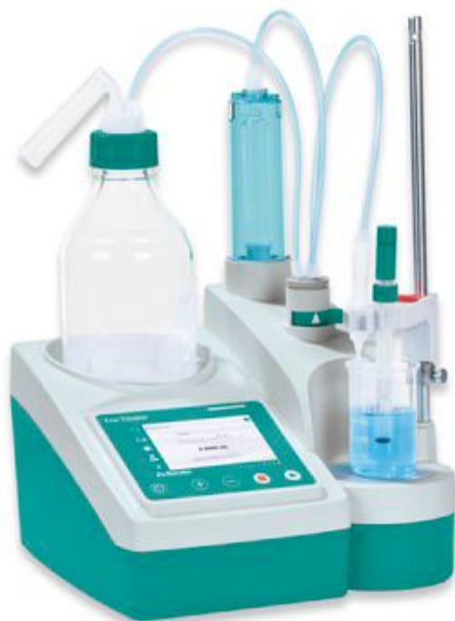
Figure 1. Eco Titrator equipped with an Ag Titrode.

The determinations are carried out on an Eco Titrator equipped with an Ag Titrode and a Polytron for sample preparation.