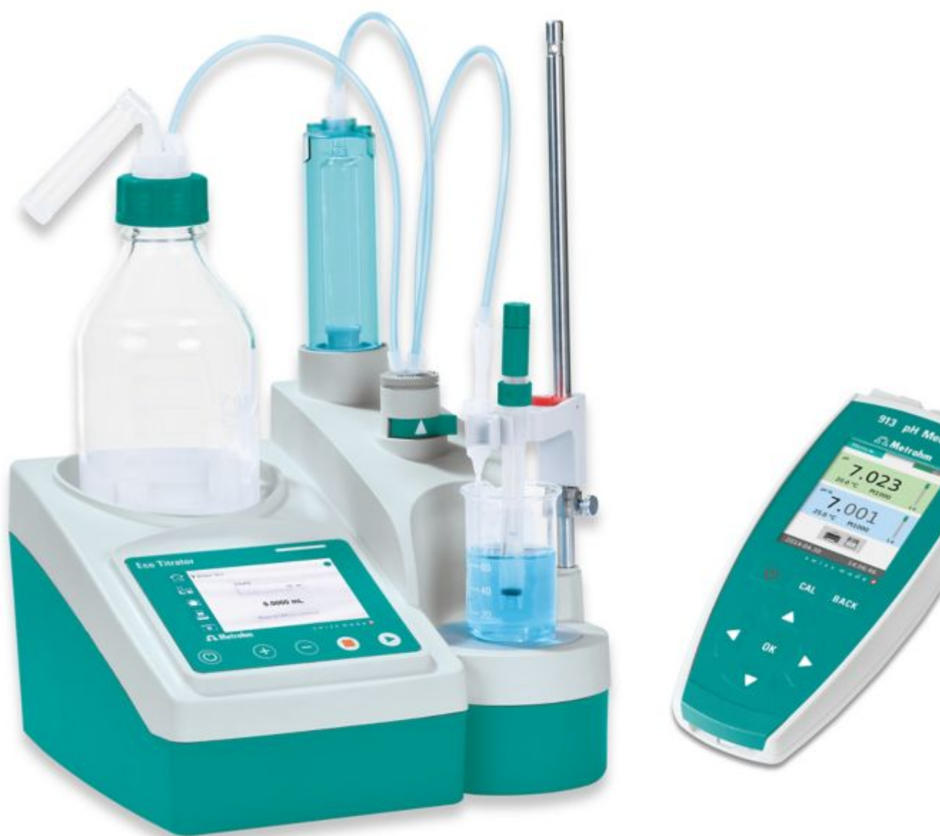
Figure 1. Eco Titrator and a 913 pH Meter with a maintenance-free Ecotrode Gel with NTC.