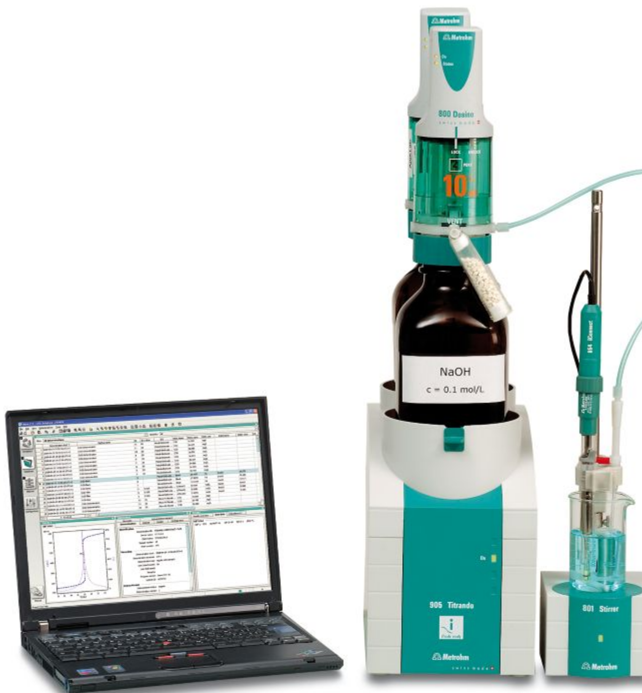
Figure 1. 905 Titrando with tiamo. Example setup for the analysis of lithium in brine.

The analysis is carried out with an automated system consisting of tiamo TM in combination with a 905 Titrando. A fluoride ion selective electrode (ISE) in combination with a Long Life ISE reference electrode is used for the indication of the titration.