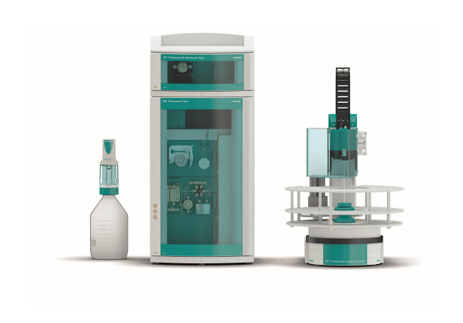
Figure 1. Instrumental setup including a 940 Professional IC Vario (center), 947 Professional UV/VIS Detector Vario SW (top center), 858 Professional Sample Processor (right), and MiPCT-ME, performed with the Metrosep A PCC 2 HC/4.0 and a Dosino (left).

After injection, the anionic components were isocratically separated within 45 minutes on a Metrosep A Supp 10 - 250/4.0 column. The UV/VIS detector signal was recorded at 215 nm. Confirmation of the method accuracy was done with a spiking study. The sample was spiked with a nitrite standard at two concentration levels (1.0 \mu g/L and 4 \mu g/L), and the recovery values were evaluated.