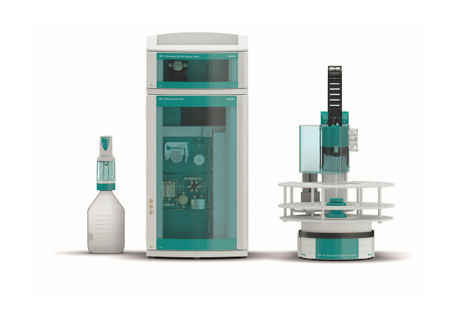
Figure 1. Instrumental setup including a 940 Professional IC Vario (center), 947 Professional UV/VIS Detector Vario SW (top center), 858 Professional Sample Processor (right), and MiPCT-ME, performed with the Metrosep A PCC 2 HC/4.0 and a Dosino (left).

Anionic components were isocratically separated on a Metrosep A Supp 10 - 250/4.0 column and the background was reduced to a minimum with sequential suppression. The UV/VIS detector signal at 215 nm was recorded. The total run time was 40 minutes. The method accuracy was confirmed by a study where samples were spiked with 4 \mu g/L NO<sub>2</sub> and the recovery values were evaluated.