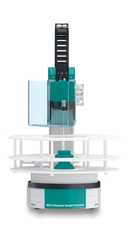
Figure 1. Instrumental setup including a 940 Professional IC Vario ONE SeS/PP/HPG, 858 Professional Sample Processor, and an 800 Dosino for Dosino regeneration of the Metrohm Suppressor Module (Metrohm Dosino Regeneration).

Fluoride was separated from acetate by applying a binary potassium hydroxide gradient (Tables 1 and 2) and using the Metrosep A Supp 16 column (L91)