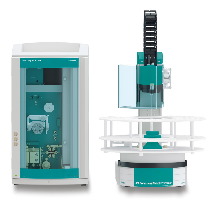
Figure 1. Instrumental setup including a 930 Compact IC Flex Oven/SeS/PP and an 858 Professional Sample Processor.