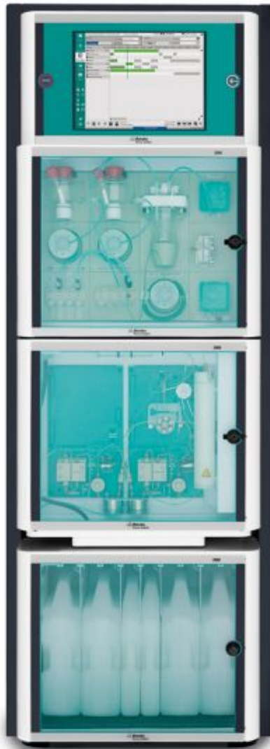
Figure 3. The 2060 IC Process Analyzer is available with either one or two measurement channels, along with integrated liquid handling modules and several automated sample preparation options. This configuration is depicted with two measurement channels (conductivity) and an optional ELGA PURELAB® flex 5/6.

Drinking water samples can be analyzed according to methods such as EPA 300.1, 317.0, 321.8, 326.0, ASTM D6581, ISO 10304-4, ISO 11206, and ISO 15061 with Metrohm Inline