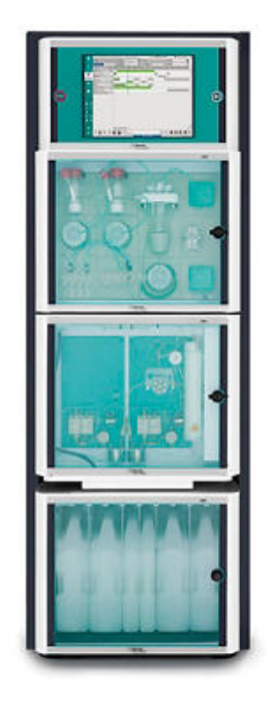
Figure 2. The Metrohm Process Analytics 2060 IC Process Analyzer, along with integrated liquid handling modules and several automated sample preparation options.

The 2060 IC Process Analyzer can run for extended periods in less-frequented areas as there is adequate space reserved for reagents, containers of ultrapure water and/or prepared eluent, and level sensors to alert users when liquid levels are low. By choosing a built-in eluent module and optional PURELAB® flex 5/6 from ELGA® for continuous pressureless ultrapure water supply, the 2060 IC Process Analyzer can be configured to run even trace analyses autonomously.