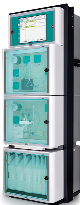
Figure 3. 2060 TI Process Analyzer from Metrohm Process Analytics.