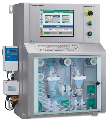
Figure 2. The 2045TI Ex proof Process Analyzer is certified for Zone 1 and Zone 2 areas.