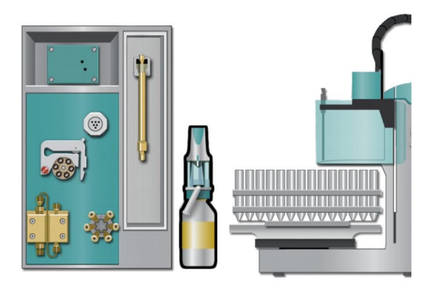
Figure 2. Compact instrumentation to quantify carbonate in sodium hydroxide: Compact IC Flex with a Dosino for MiPT and a 858 Professional Sample Processor.