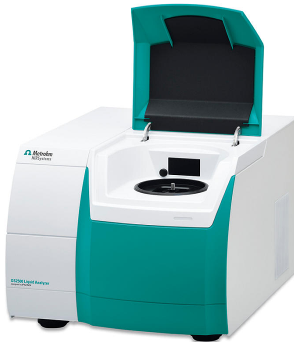
Figure 1. Metrohm NIRS DS2500 Liquid Analyzer used for the measurement of iodine value in soybean-palm oil blends.