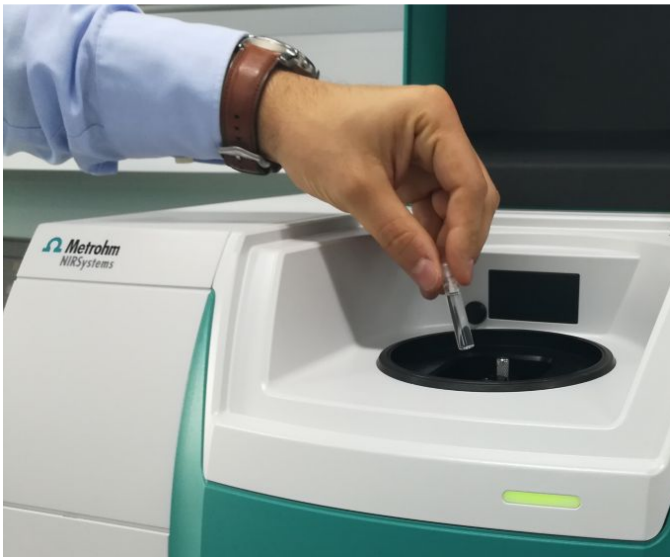
Figure 1. DS2500 Liquid Analyzer and a diesel exhaust fluid sample filled in a disposable vial.

Aqueous urea samples with different urea content from 0.5% to 40% (v/v) were measured in transmission mode with a DS2500 Liquid Analyzer over the full wavelength range (400–2500 nm). Reproducible spectrum acquisition was achieved using the built-in temperature control at 40 °C. For convenience, disposable vials with a path length of 2 mm were used, which made cleaning of the sample vessels unnecessary. The Metrohm software package Vision Air Complete was used for all data acquisition and prediction model development.