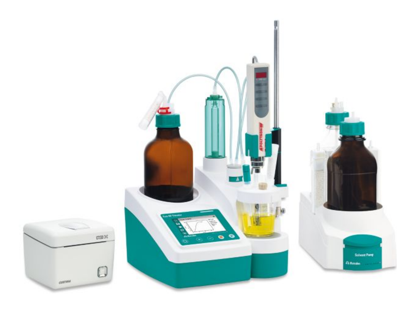
Figure 1. Eco KF Titrator equipped with a Polytron, a Solvent Pump, and a double Pt-wire electrode for volumetric Karl-Fischer titration.