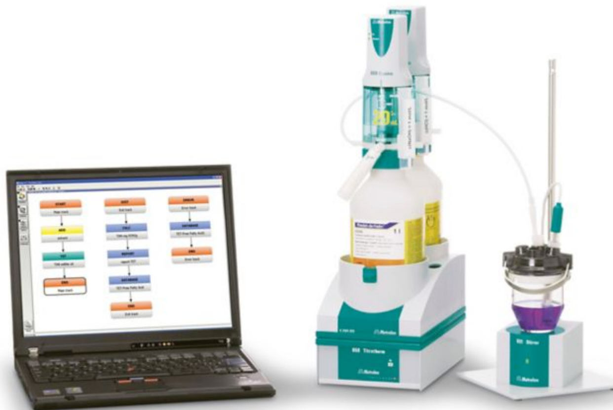
Figure 1. 859 Titrotherm with tiamo. Example setup for the thermometric titration of ferrous iron.

An 859 Titrotherm which is equipped with a Thermoprobe and controlled by tiamo TM is used for this application.