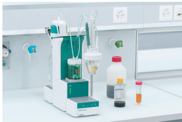
Figure 1. OMNIS Titrator Professional equipped with a dThermoprobe and a rod stirrer.

An appropriate amount of sample is pipetted into the titration vessel and deionized water is added. Afterwards, the solution is titrated until after the third exothermic endpoint with standardized sodium hydroxide (Figure 2).