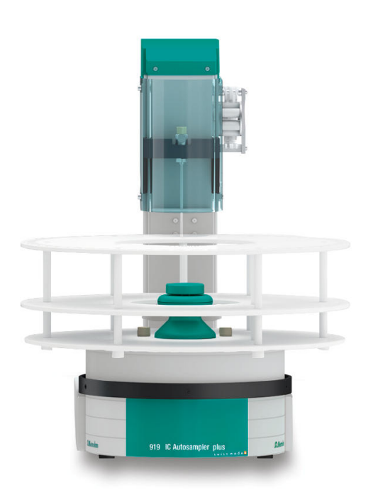
Figure 1. Instrumental setup including a 930 Compact IC Flex with the IC Conductivity Detector MB (L) and the 919 IC Autosampler plus (R).

For sodium bicarbonate compounded injections, 8.4 g of sodium bicarbonate was dissolved in 100 mL sterile Water for Injection [4]. Further manual dilution was performed using ultrapure water (100-fold dilution) to achieve a nominal concentration of 0.23 mg/mL. Sample stock solutions for the sodium phosphates compounded injections were prepared from 24 g of monobasic sodium phosphate and 14.2 g of dibasic