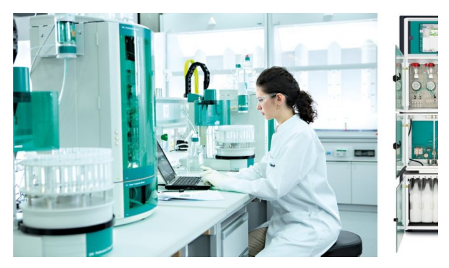
Figure 2. Ion chromatographs for laboratories (left) and for process analytics (right).