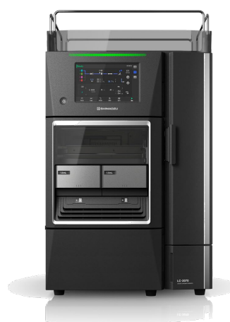
Fig. 1 Integrated LC System "i-Series" (LC-2080C 3D)

*2 : X = 90, 91, 92, 93, 94 (5 patterns)