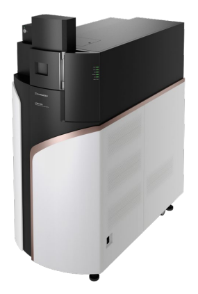
Fig. 1 LCMS-9050 and DPiMS<sup>™</sup> QT

Probe actuation parameter settings and the method settings for MS and MS/MS analysis are indicated in Tables 1 and 2. Only the positive mode was used for this analysis, however LCMS-9050 systems are also capable of high-speed switching between positive and negative modes to flexibly analyze multiple types of substances.