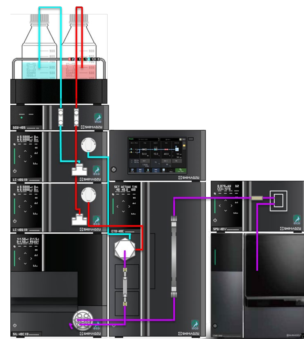
Fig. 1 Illustration of the delay column set up on the compact single quadrupole LC-MS.

A scan event with a m/z range of 50 - 750 was established to monitor the targeted standards. In the same acquisition, selected ion monitoring (SIM) channels were also set up for each PFAS analyte for the ease of quantitation. The [M-H] - ions were automatically generated based on the chemical formula in the acquisition method.