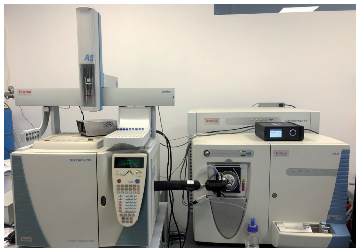
Figure 3 - GC-SICRIT®-MS on LC-MS instrument (here: Thermo Orbitrap HRMS).

The SICRIT® Ion Source together with the GC/SPME Module allow for a seamless and easy coupling of any GC to any LC-MS within minutes.* This enables routine GC analyses on your existing LC-MS with no change in analysis software or methods. The soft ionization of the SICRIT® Ion Source even allows you to directly transfer MRMs used in LC-MS methods to GC-analyses. Therefore, method transfer from LC to GC has never been as easy as with SICRIT®.