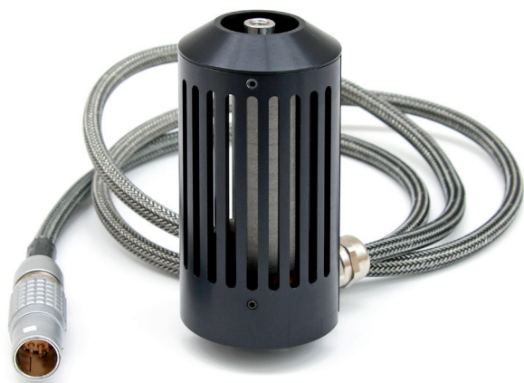
Figure 1 - SICRIT® GC/SPME Module for use with SICRIT® Ionization.

The SICRIT® GC/SPME Module connects state-of-the-art sample enrichment and separation techniques with your SICRIT® Ion Source.