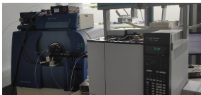
Figure 1 - SICRIT® cold-plasma ion source features soft ionization GC-HRMS coupling (SCIEX TripleTOF 5600)