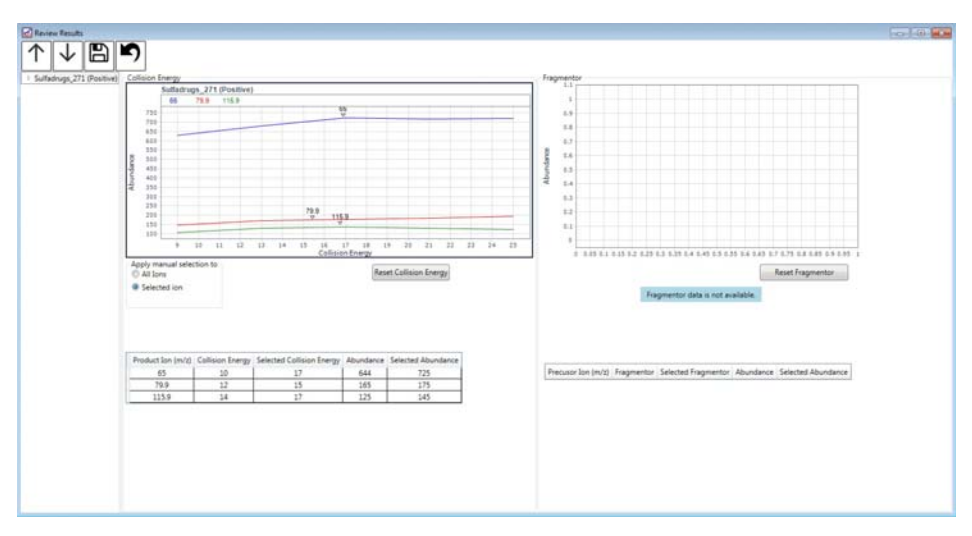
Figure 1 Review Results dialog box

To manually set collision energy voltages