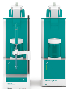
Figure 1. OMNIS Titrator with the digital pH electrode and an OMNIS Dosing Module.

Metrohm: Titrate the sample directly with 0.1 mol/L HCl solution until after the first equivalence point (EP).