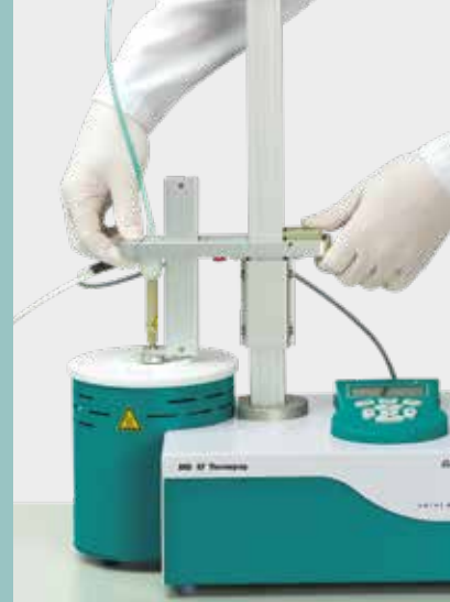
End of titration: After the titration the vial is removed from the oven

For your safety: You can be sure to always hit the septum. The guiding support prevents the needle from descending outside the septum area.