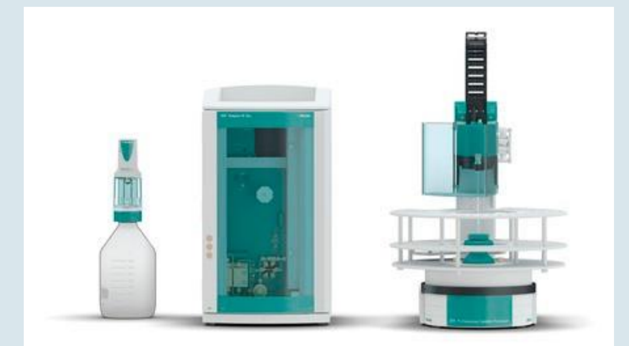
Fig 3: Ion Chromatography instrument used for drug substance impurity