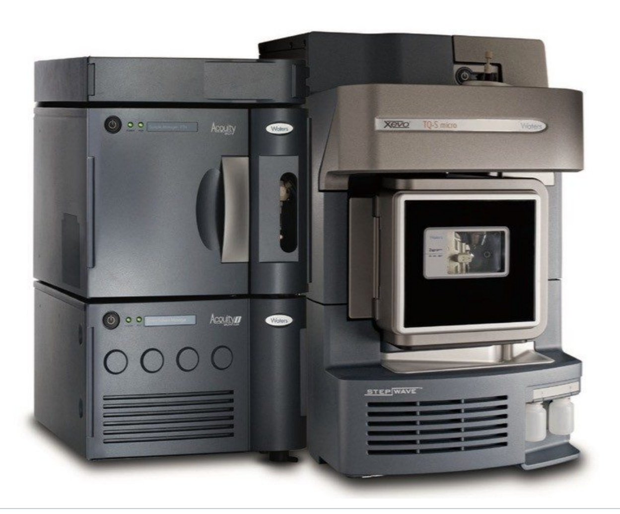
Figure 1. ACQUITY UPLC I-Class and Xevo TQ-S micro configuration.

Clinical research, laboratories require reliable testing techniques that can detect a wide variety of toxicants in highly complex biological matrices, such as ante and postmortem specimens. The Waters targeted clinical research analytical sensitivityapplication using the ACQUITY TQD System was released in 2009.<sup>1</sup> This approach has been used by Rosano et al to compare screening methodologies for postmortem blood samples.<sup>2</sup> Following its success, this solution was transferred in 2013 to the ACQUITY UPLC I-Class and Xevo TQD system.<sup>3</sup> The release of the Xevo TQ-S micro allows for further evolution of this solution.<sup>4</sup>