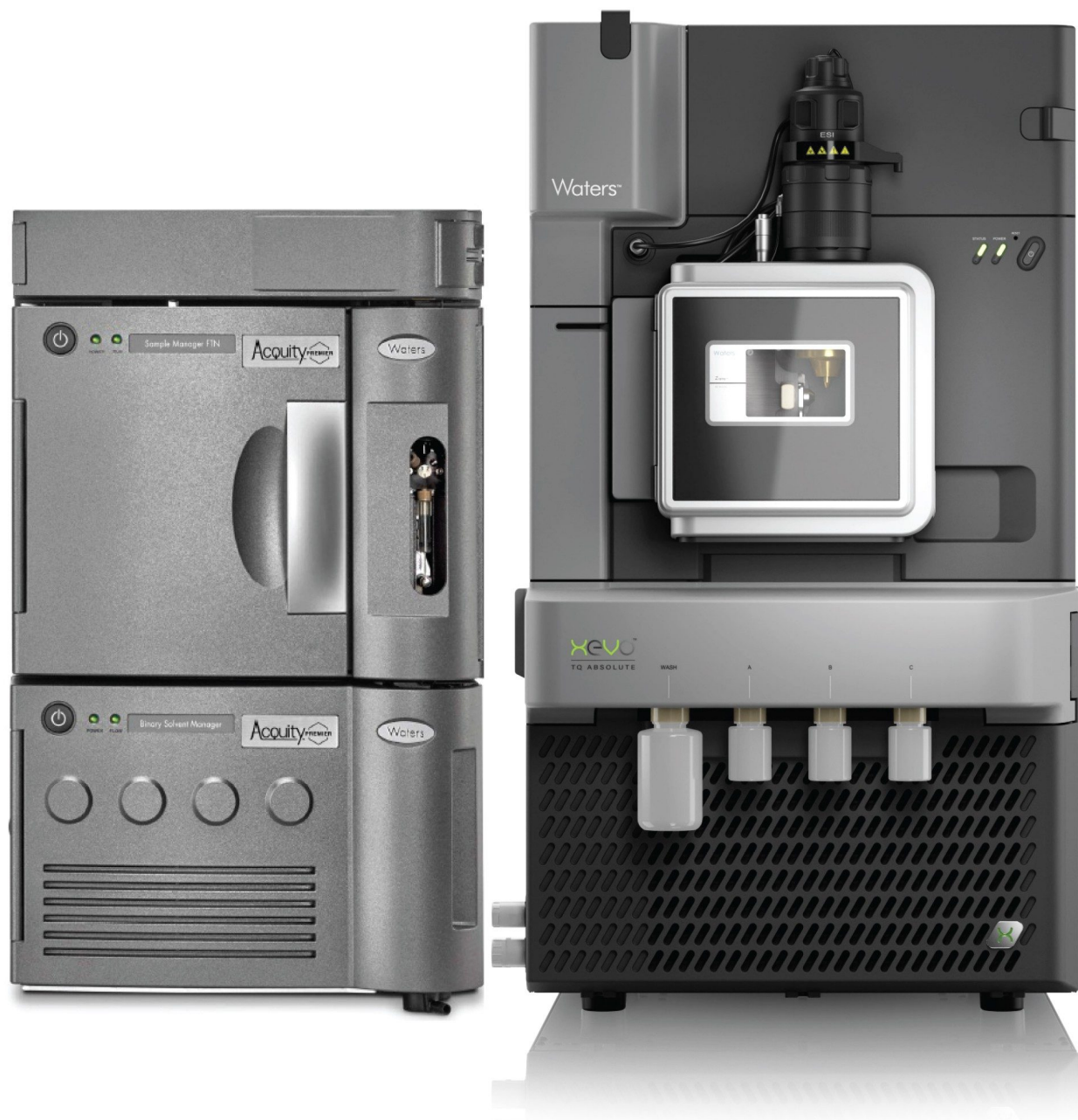
Figure 1. The Waters Xevo TQ Absolute Mass Spectrometer.