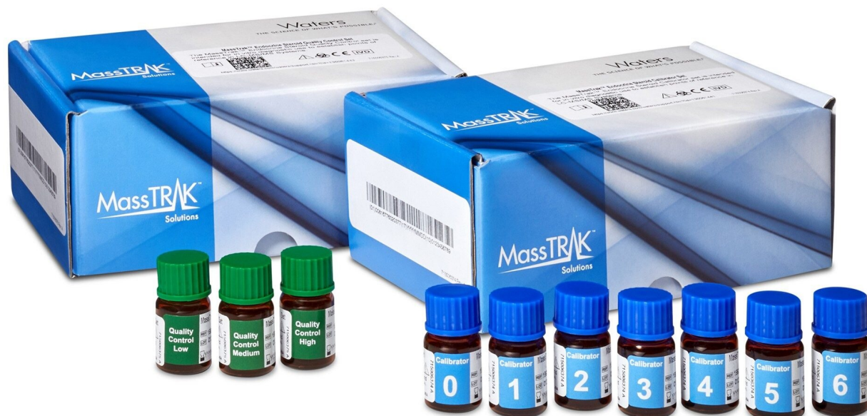
Figure 1. The Waters MassTrak Immunosuppressant Calibrator and Quality Control Sets.