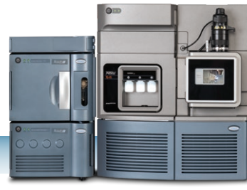
Complex trace analyte quantification

Clinical Diagnostics is more than collecting data - you are transforming data into better care.