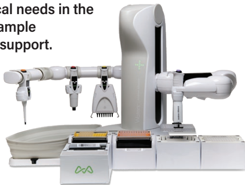
Andrew the pipetting robot