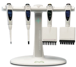
Pipette easy pipetting

Our full range of workflow solutions covers all your LC-MS/MS analytical needs in the clinical laboratory - from sample preparation to service and support.