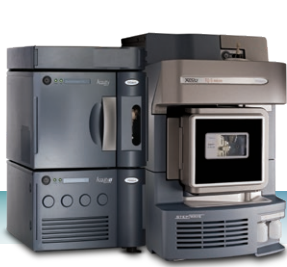
Routine and low concentration analyte quantification