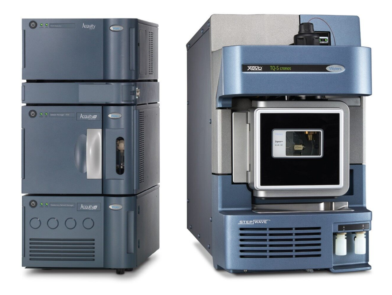
Figure 2. ACQUITY UPLC H-Class PLUS System and Xevo TQ-S cronos Tandem Quadrupole Mass Spectrometer.