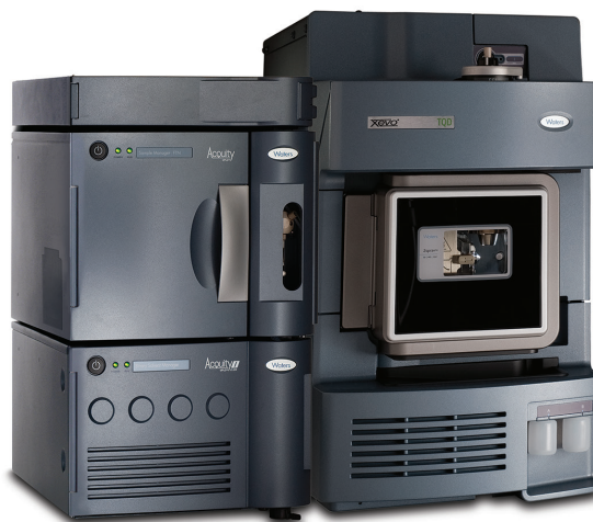
Figure 1. The Waters ACQUITY UPLC I-Class and Xevo TQD.

Here we describe a clinical research method utilizing Oasis PRiME HLB \mu Elution Plate technology for the extraction of testosterone, androstenedione, and DHEAS from serum, which has been automated on a Tecan Freedom Evo 100/4 Liquid Handler. Chromatographic separation was performed on an ACQUITY UPLC I-Class System using an ACQUITY UPLC HSS T3 VanGuard Pre-column and ACQUITY UPLC HSS T3 Column, followed by detection on a Xevo TQD Mass Spectrometer (Figure 1). In addition, we have evaluated External Quality Assessment (EQA) samples for testosterone, androstenedione, and DHEAS to evaluate the bias and therefore suitability of the method for analyzing testosterone, androstenedione, and DHEAS for clinical research.