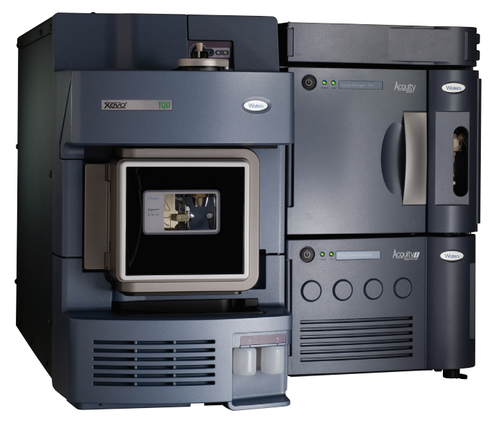
Figure 1. The Waters ACQUITY UPLC I-Class System with the Xevo TQD.

Here we describe a clinical research method using deproteination of plasma or serum samples with methotrexate- {}^{2}H_{3} internal standard in methanol. Isocratic separation was achieved within five minutes using an ACQUITY UPLC HSS C<sub>18</sub> SB Column (2.1 x 30mm, 1.8 µm) on an ACQUITY UPLC I-Class System followed by detection on a Xevo TQD Mass Spectrometer (Figure 1).