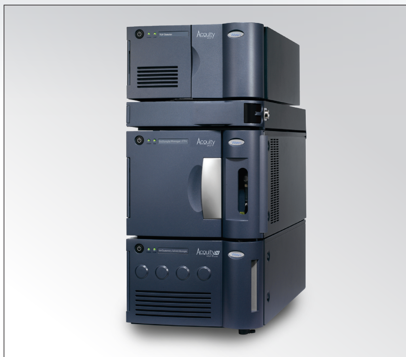
Figure 1. ACQUITY UPLC® H-Class System with PDA Detector.

The separation of all 13 dyes was achieved in less than eight minutes.