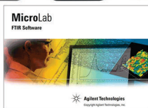
Agilent 4300 Handheld FTIR

The Agilent Aerospace Analyzer is a handheld, portable, mid-infrared Fourier transform spectrometer (FTIR) that is specifically equipped to provide high-quality, nondestructive analysis of aerospace materials including composites, polymers, coatings, and metal surfaces.