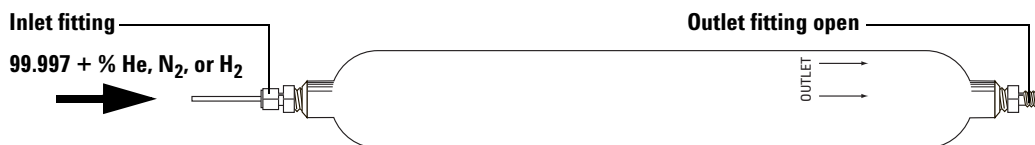
Figure 2 Outlet fitting open