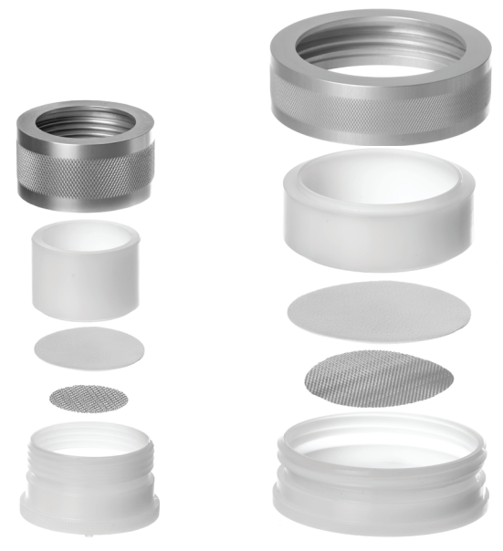
Figure 1. The disk holder assembly for 47 mm and 90 mm SPE disks.

Place a disk inside a disk holder; see Figure 1. The VacMaster Disk unit is compatible with any Luer connected Solid Phase Extraction disk holders from Biotage.