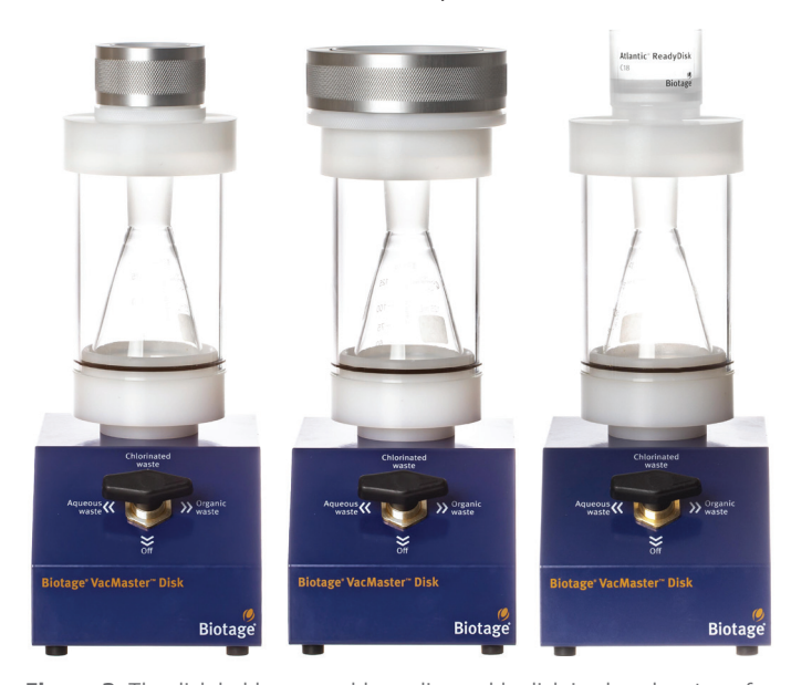
\textbf{Figure 3.} \ \, \textbf{The disk holder assembly or disposable disk is placed on top of the collection chamber during the elution.}