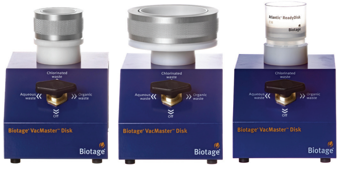
Figure 2. The disk holder assembly or disposable disk is placed directly onto the VacMaster Disk unit during the conditioning and sample loading. The picture shows a 47 mm SPE disk holder assembly, a 90 mm SPE disk holder assembly, and a disposable Atlantic* ReadyDisk.

Condition the disk per method requirements. Turn the 4-way valve to the correct waste location.